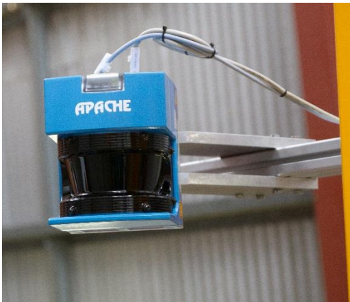
(a) Laser Measuring Scanner