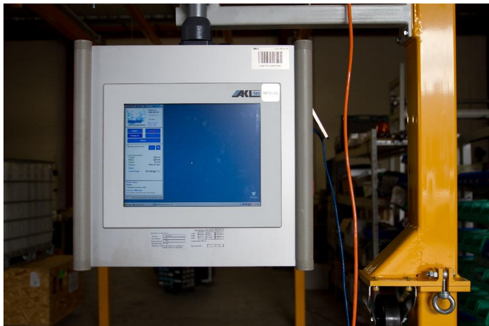
(b) AKL-tec Model "emPC-MCD" Personal Computer