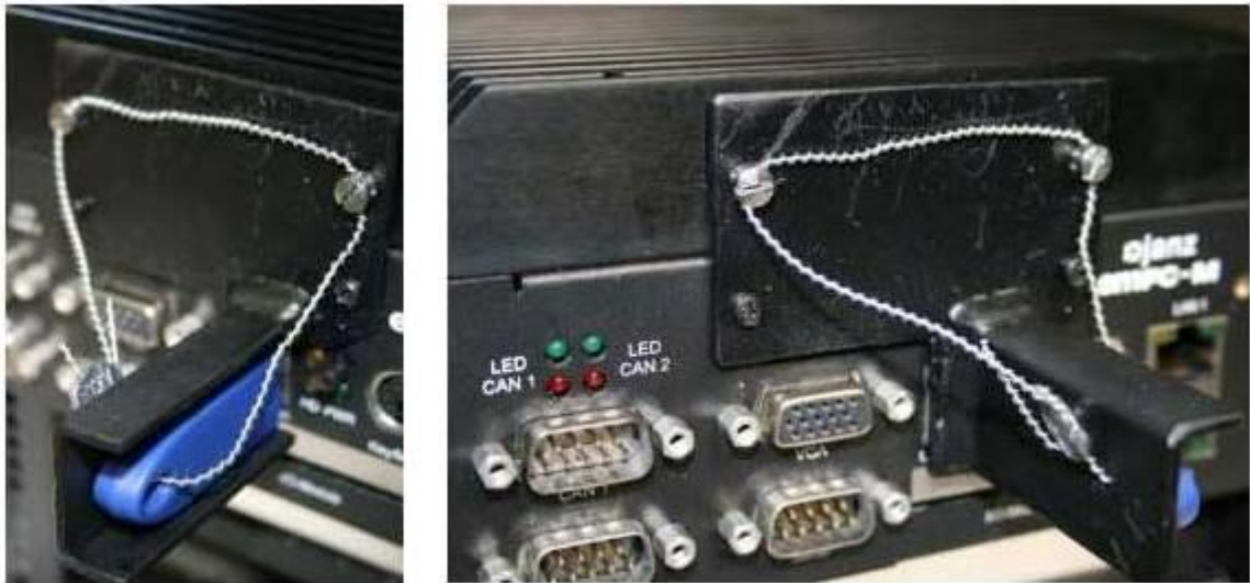
Sealing of USB Port Cover Plate and Checksum Dongle